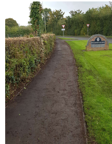
Photos: Stretton Road gateway into the village: Before and after clean-up