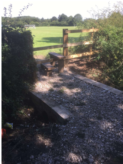
Photo: One of the new stiles installed at the Craythorne Road playing field

Since the last edition we have been able to complete the replacement and repair of many of the stiles around the village. These now offer much more robust and secure crossing points as well as in many places, protection against the winter weather. A new website has also been launched showing a range of walks in Rolleston and the surrounding area – please visit http://rollestonondovelocalwalks.co.uk for further details.